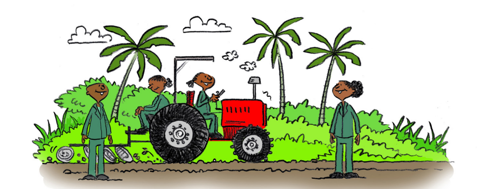
SIMULATION AND WORK BASED PRACTICE