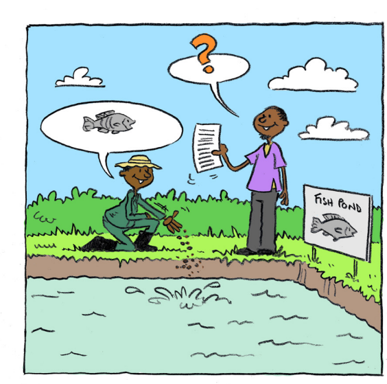
PROJECT BASED LEARNING