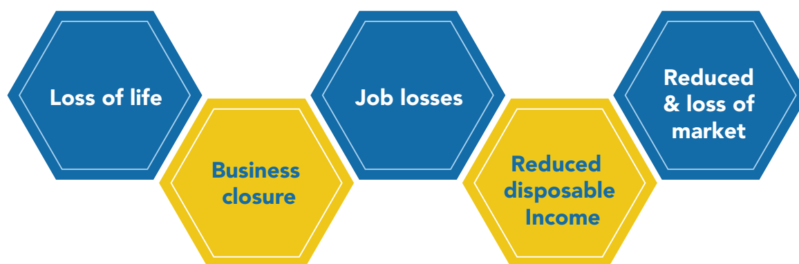
Table 2: Impact of COVID-19 on the jua kali sector

The MSME/Jua Kali sector has borne the full brunt of the negative effects of COVID 19 as illustrated on Table 2 with the KNFJKA taking lead in building the resilience of its members through various initiatives (Table 3) though there are gaps that continue to persist (Table 4)