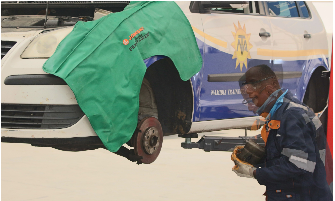
WORLDSKILLS AFRICA, SWAKOPMUND NAMIBIA 2022