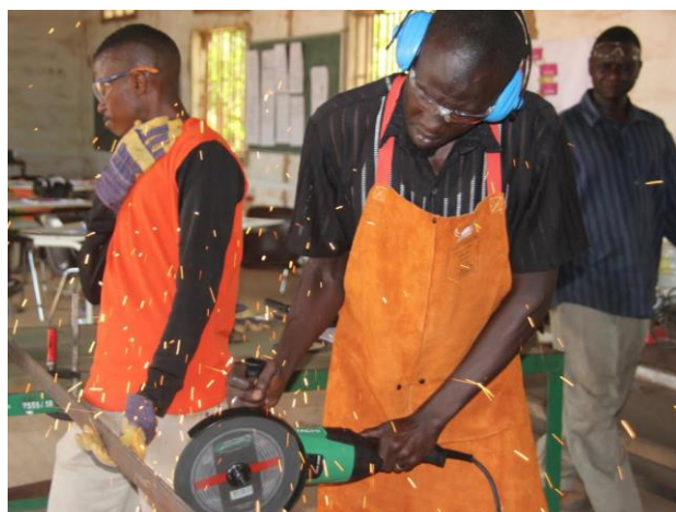
Course in rural mechanics at GTTI